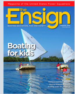
Ensign Summer 2015